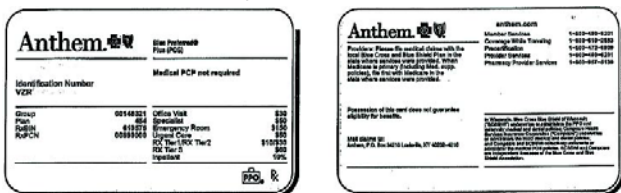
Example – Fully insured local member